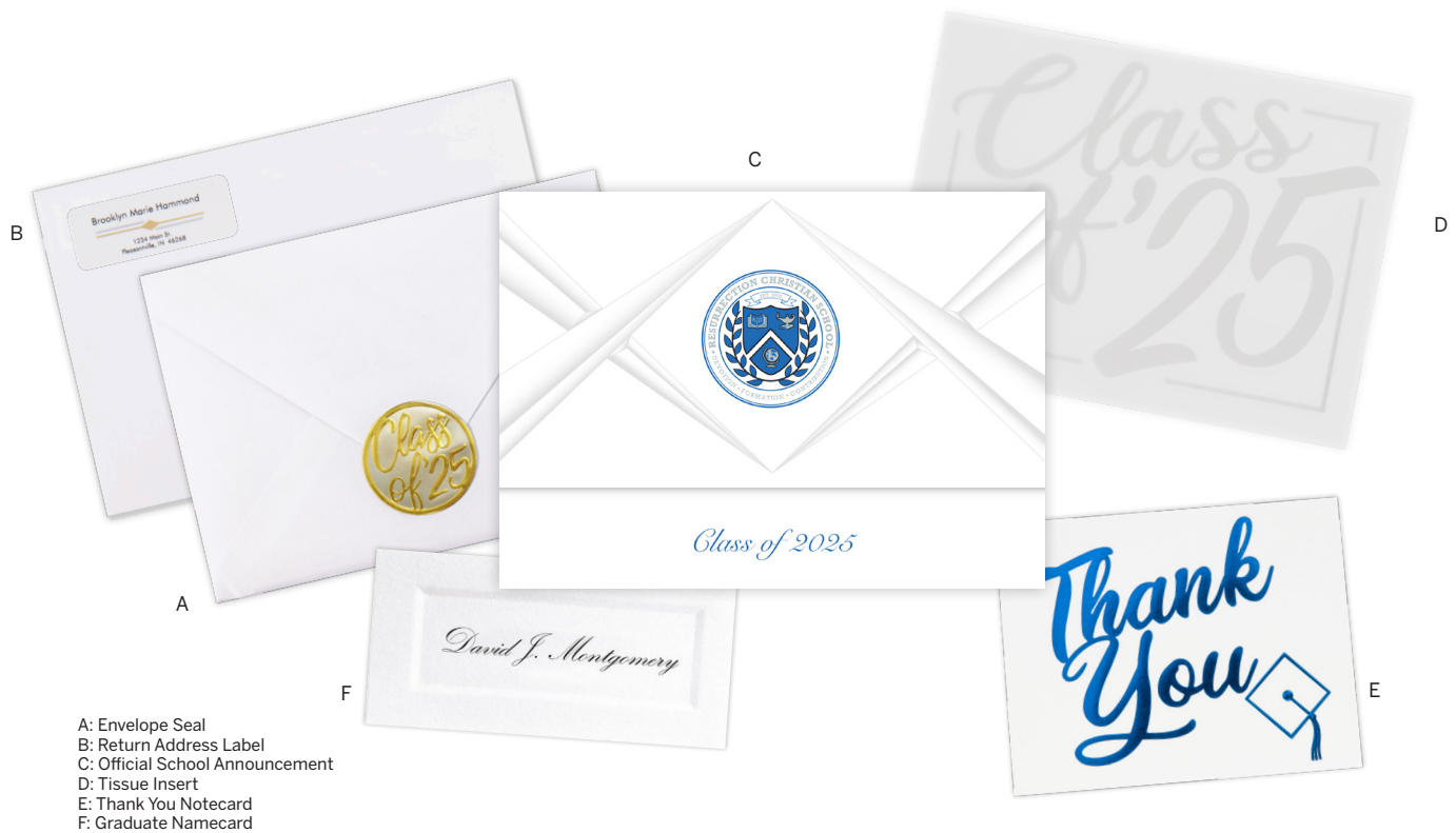
A: Envelope Seal B: Return Address Label C: Official School Announcement D: Tissue Insert E: Thank You Notecard F: Graduate Namecard