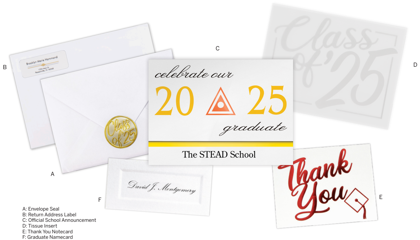
A: Envelope Seal B: Return Address Label C: Official School Announcement D: Tissue Insert E: Thank You Notecard F: Graduate Namecard