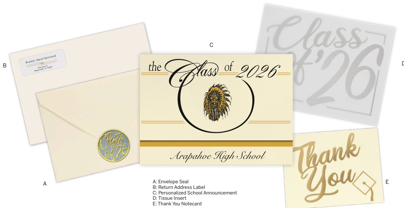
A: Envelope Seal B: Return Address Label C: Personalized School Announcement D: Tissue Insert E: Thank You Notecard