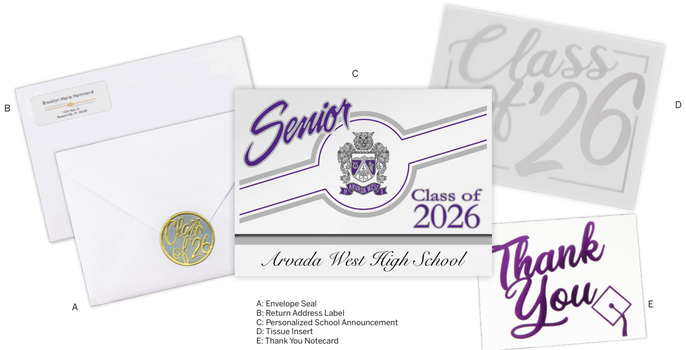
A: Envelope Seal B: Return Address Label C: Personalized School Announcement D: Tissue Insert E: Thank You Notecard