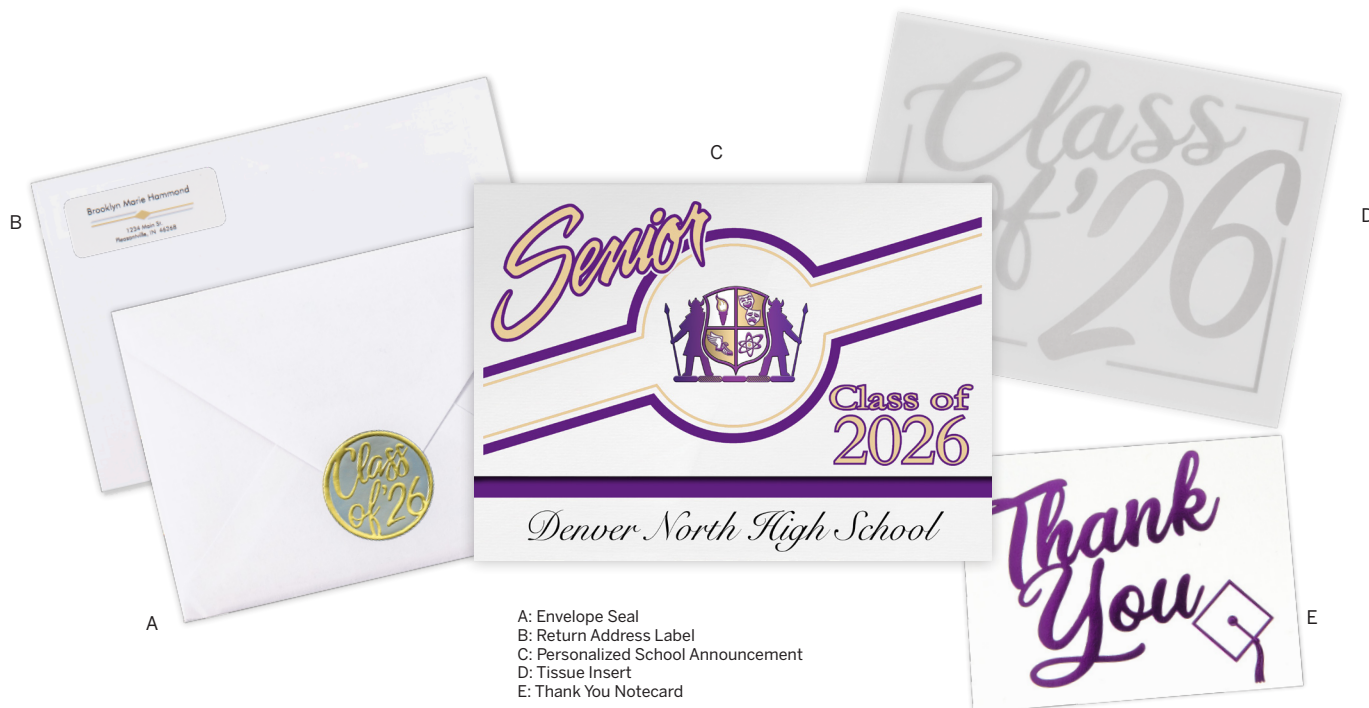
A: Envelope Seal B: Return Address Label C: Personalized School Announcement D: Tissue Insert E: Thank You Notecard