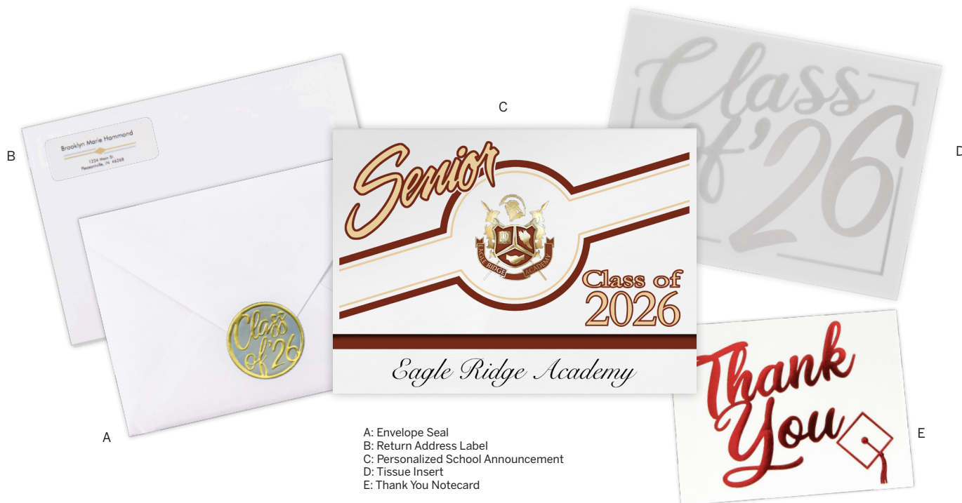
A: Envelope Seal B: Return Address Label C: Personalized School Announcement D: Tissue Insert E: Thank You Notecard