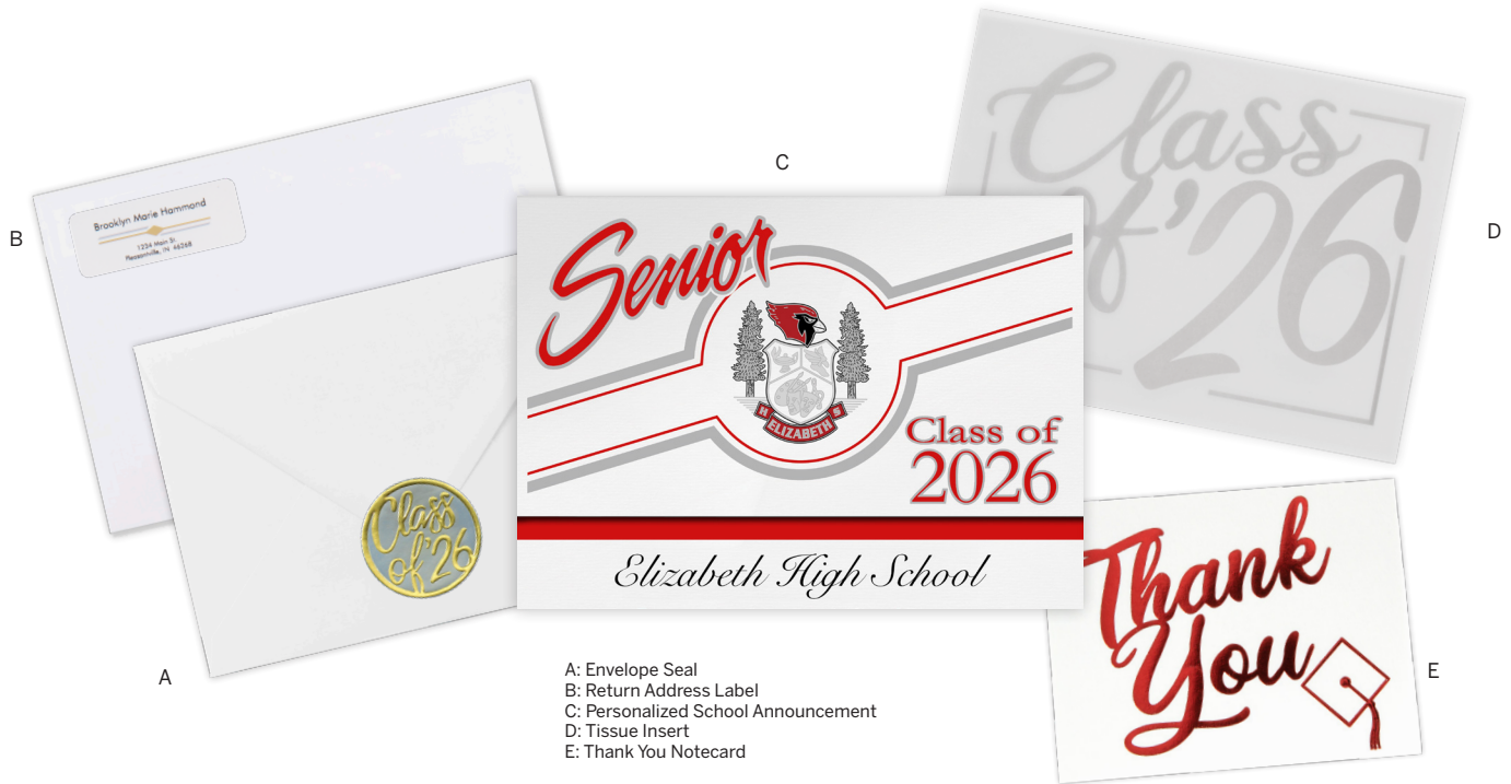
A: Envelope Seal B: Return Address Label C: Personalized School Announcement D: Tissue Insert E: Thank You Notecard