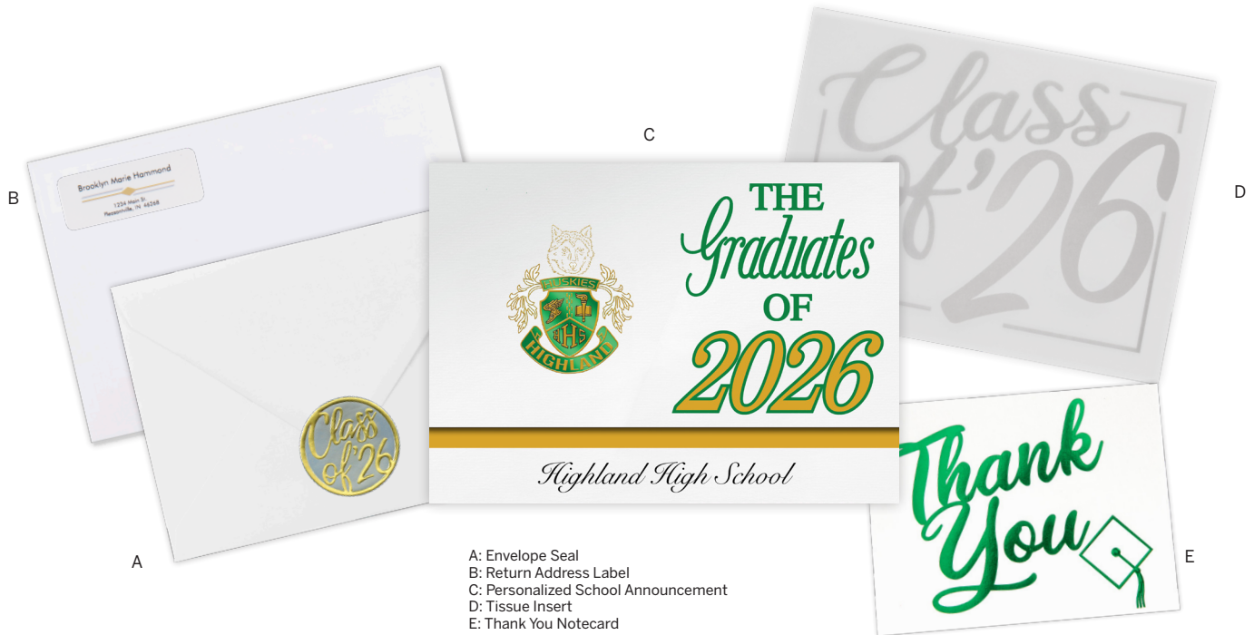
A: Envelope Seal B: Return Address Label C: Personalized School Announcement D: Tissue Insert E: Thank You Notecard