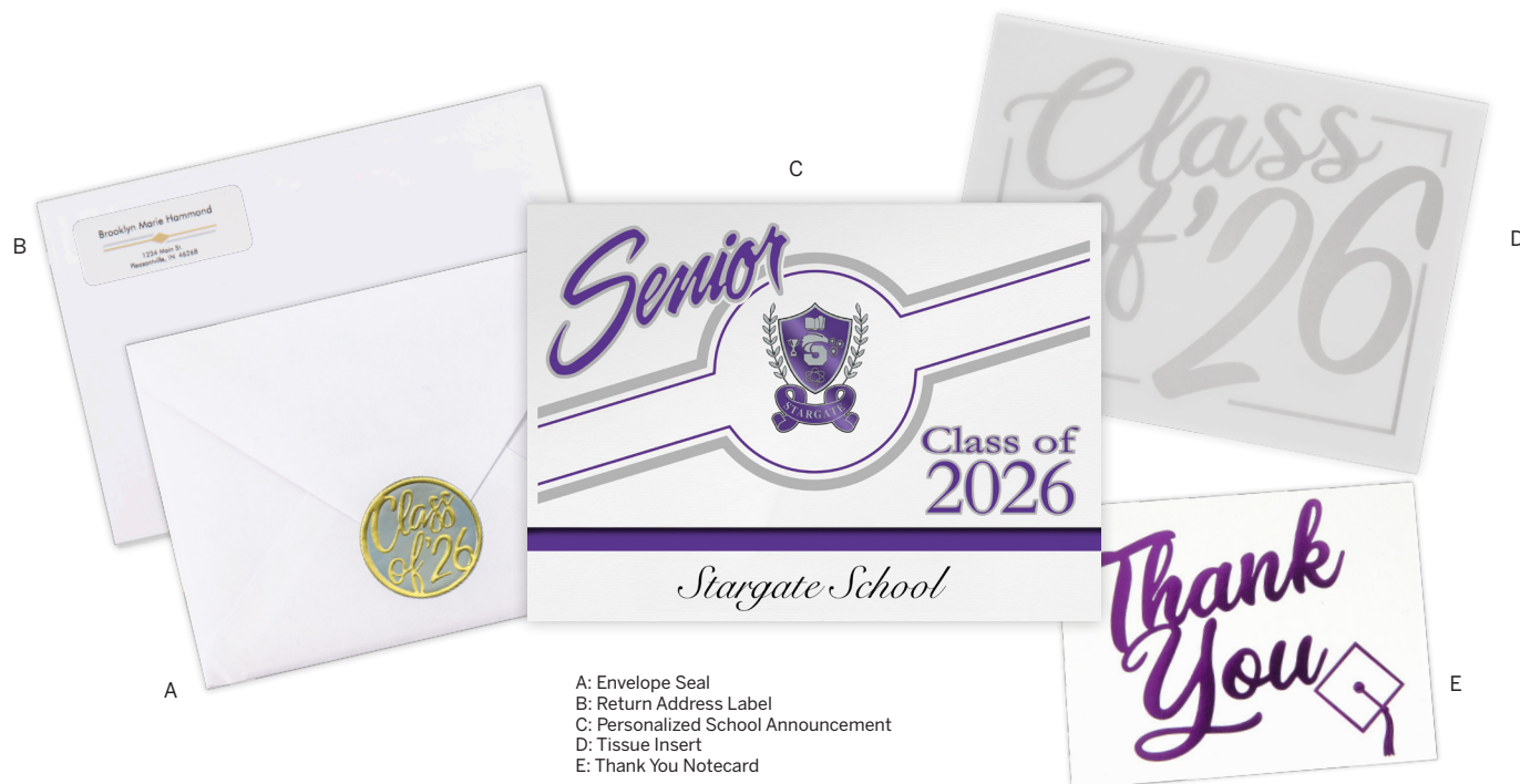
A: Envelope Seal B: Return Address Label C: Personalized School Announcement D: Tissue Insert E: Thank You Notecard