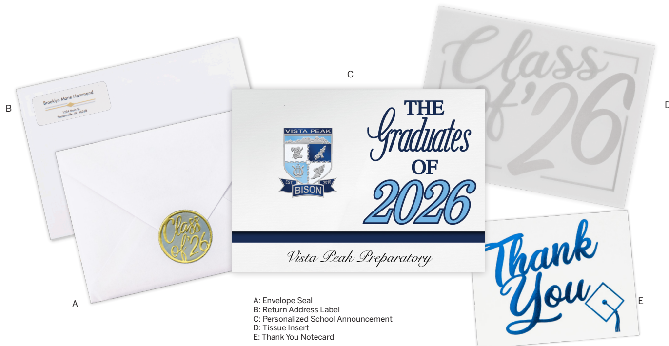
A: Envelope Seal B: Return Address Label C: Personalized School Announcement D: Tissue Insert E: Thank You Notecard