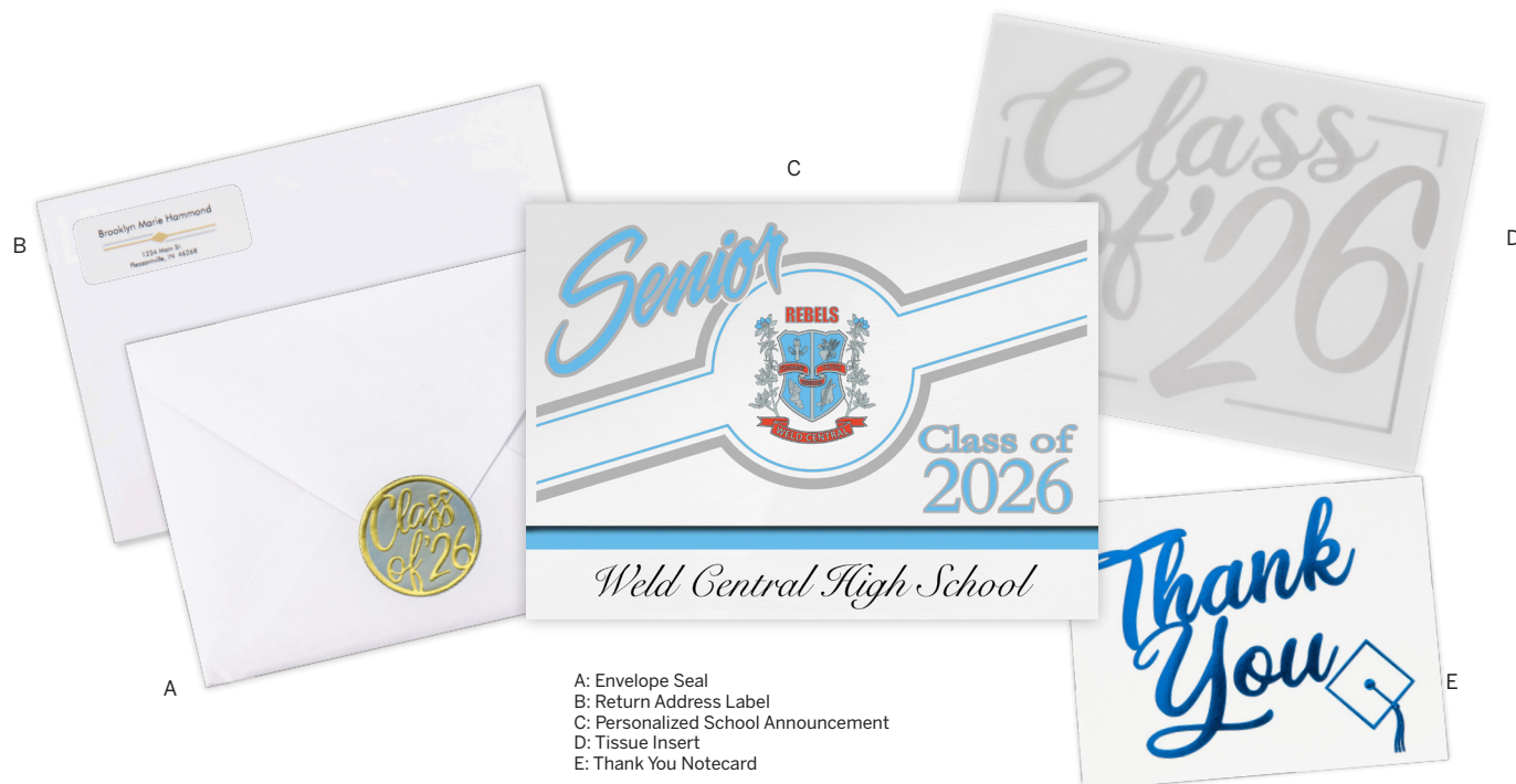
A: Envelope Seal B: Return Address Label C: Personalized School Announcement D: Tissue Insert E: Thank You Notecard