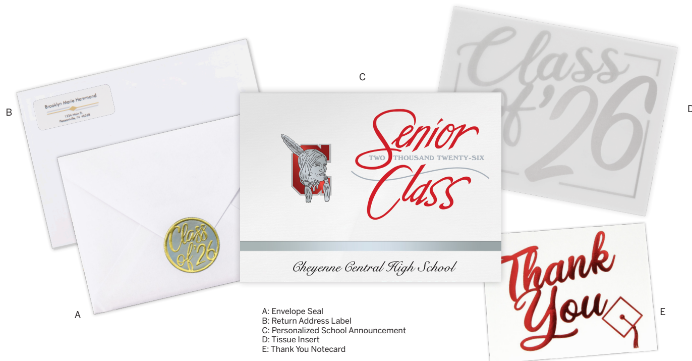
A: Envelope Seal B: Return Address Label C: Personalized School Announcement D: Tissue Insert E: Thank You Notecard