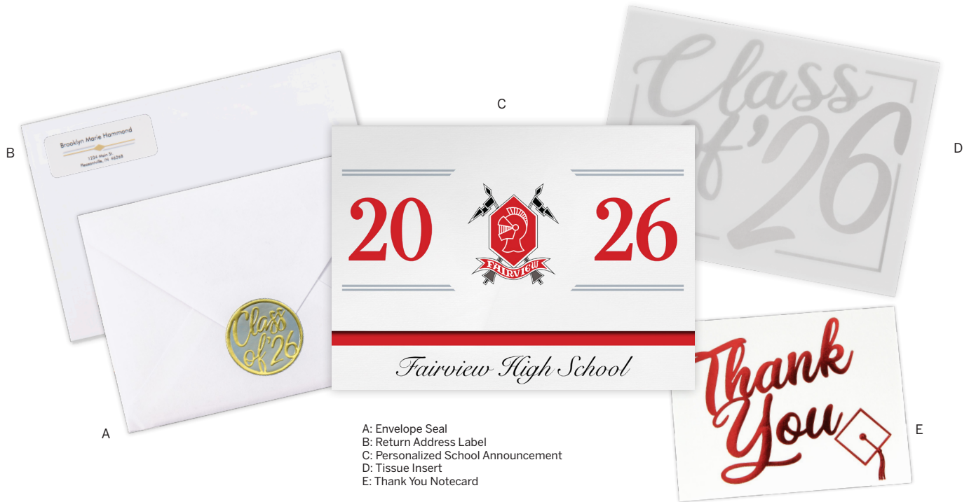
A: Envelope Seal B: Return Address Label C: Personalized School Announcement D: Tissue Insert E: Thank You Notecard