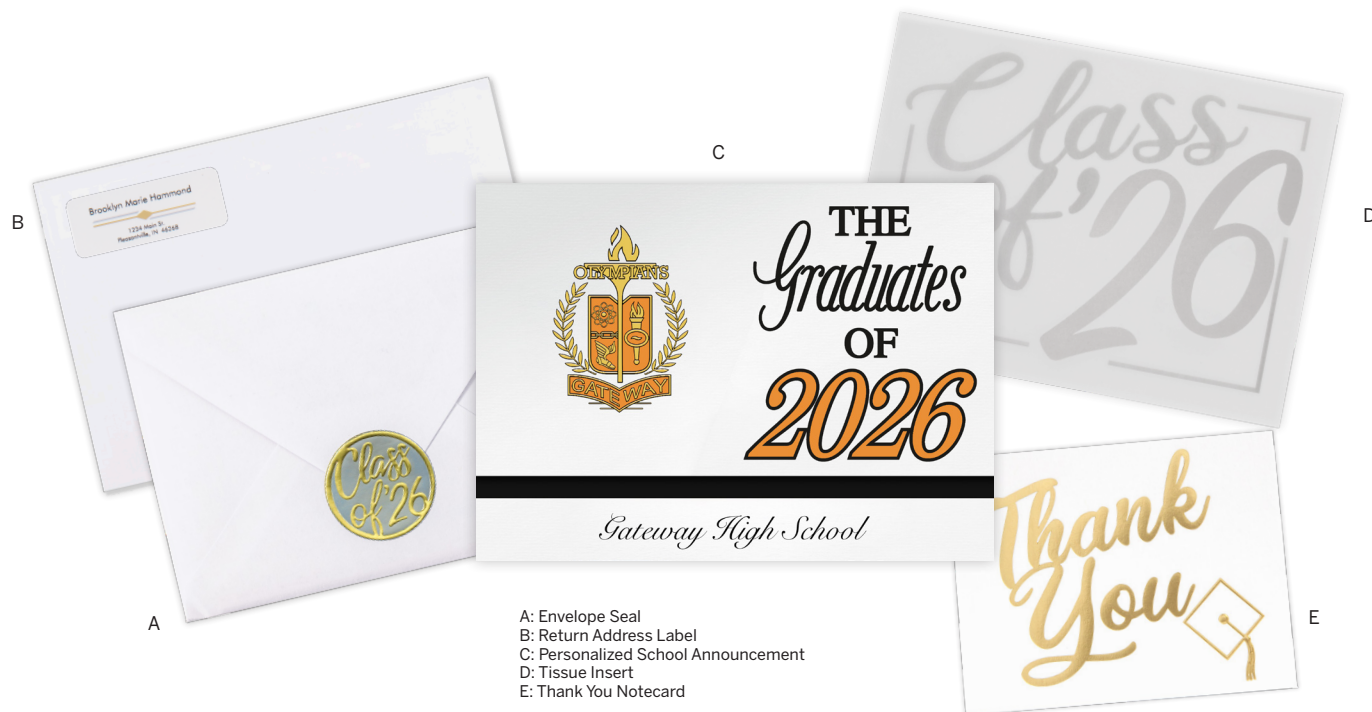
A: Envelope Seal B: Return Address Label C: Personalized School Announcement D: Tissue Insert E: Thank You Notecard