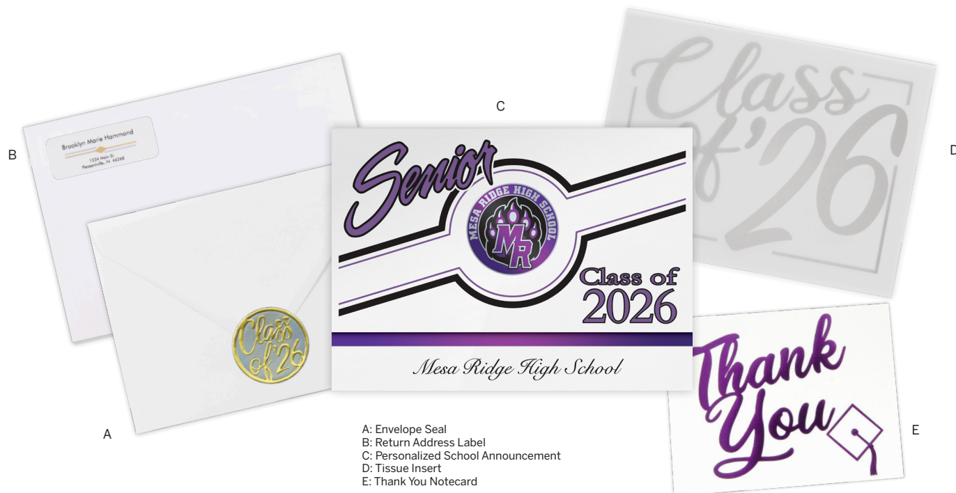
A: Envelope Seal B: Return Address Label C: Personalized School Announcement D: Tissue Insert E: Thank You Notecard