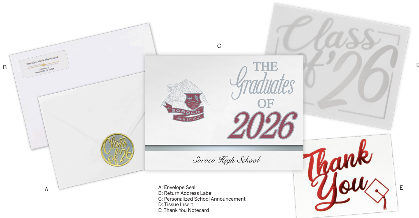
A: Envelope Seal B: Return Address Label C: Personalized School Announcement D: Tissue Insert E: Thank You Notecard