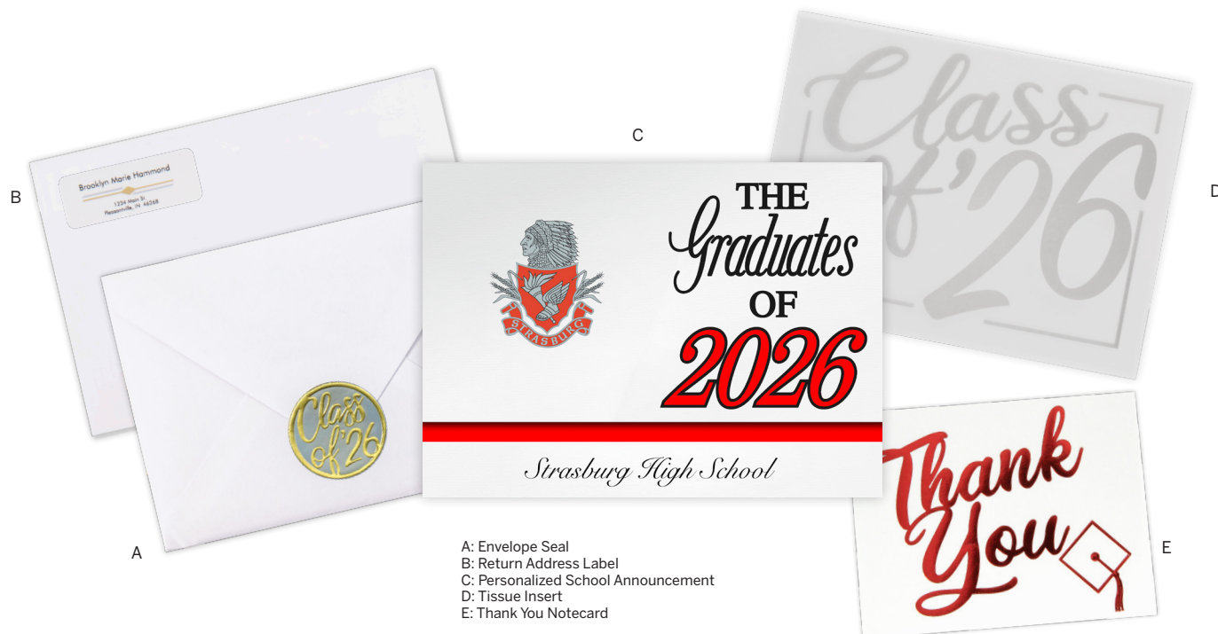
A: Envelope Seal B: Return Address Label C: Personalized School Announcement D: Tissue Insert E: Thank You Notecard