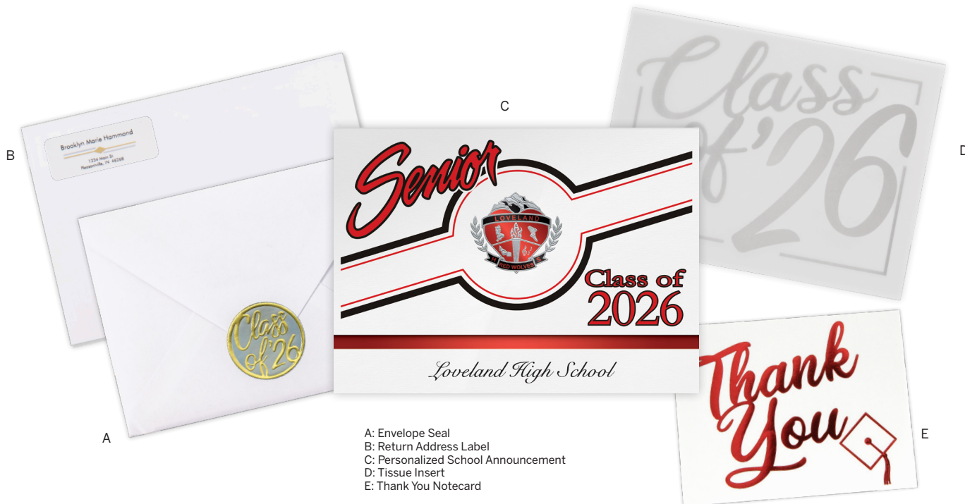
A: Envelope Seal B: Return Address Label C: Personalized School Announcement D: Tissue Insert E: Thank You Notecard